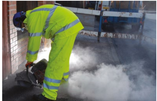
Figure 1 Common tasks like cutting can create very high dust levels

However, most of these diseases take a long time to develop. Dust can build up in the lungs and harm them gradually over time. The effects are often not immediately obvious. Unfortunately, by the time it is noticed the total damage done may already be serious and life changing. It may mean permanent disability and early death.