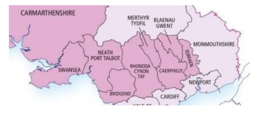
Figure 1: The Gwent Region Blaenau Gwent, Caerphilly, Newport, Monmouthshire and Torfaen<sup>7</sup>

Newport<sup>4</sup> is twelve miles north east from Cardiff. It is the largest urban area in Gwent and covers a geographical area of 190 square kilometres. Monmouthshire<sup>5</sup> is in the south east corner of Wales and shares a boarder with England. Monmouthshire is geographically large compared to many local authority areas in Wales. It covers 880 square kilometres and is semi-rural in nature. Main towns include Abergavenny, Usk, Raglan, Chepstow, Coldicot and Magor. The county borough of Torfaen<sup>6</sup> Is in the south-east of Wales it boarders Newport to the south, Monmouthshire to the east and Caerphilly and Blaenau Gwent to the west and north-west. Torfaen is the third smallest borough in Wales covering 128 square kilometres.