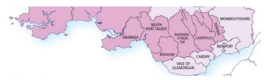
Figure 1: Cardiff & the Vale of Glamorgan<sup>5</sup>

The city of Cardiff is the largest urban area<sup>4</sup> in Wales. It is in South-East Wales placed on the M4 motorway with Swansea being 42.5 miles to the east and Bristol being 44 miles to the west. The Vale of Glamorgan is a geographically diverse part of Wales consisting of countryside, coastal communities, busy towns and rural villages. It also includes Cardiff Airport, various industries and businesses and Barry which is Wales's largest town.